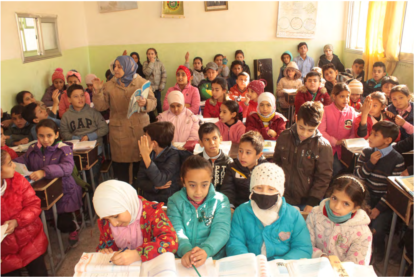
Photo above: Children are seen in a classroom in Hasakah Province in northeastern Syria on Nov. 19, 2020.

NES is characterized by large pockets of OOSC, with oversaturation of education service delivery in some formal camps for internally displaced persons (IDPs) using catch-up curriculum, while other informal settlements remain under-served. 69 Several of the country's largest IDP camps are located within this region. Approximately 1.4 million children and youth are in need of education services in AANES. 70 The various curricula taught (see Figure 1) designate the language of instruction for learners in AANES. As with NWS, lack of age-appropriate learning opportunities in NES has contributed to high rates of OOSC. 71 Activities using a catch-up curriculum are administered in English and Arabic, but authorities in AANES implement their own curricula in Kurdish 72 as well as in the Syriac language. 73 There is anecdotal evidence that administering Kurdish curricula in AANES has pushed some parents to move to the GoS-held part of al-Hasakah province in order to access the recognized, Arabic-language GoS