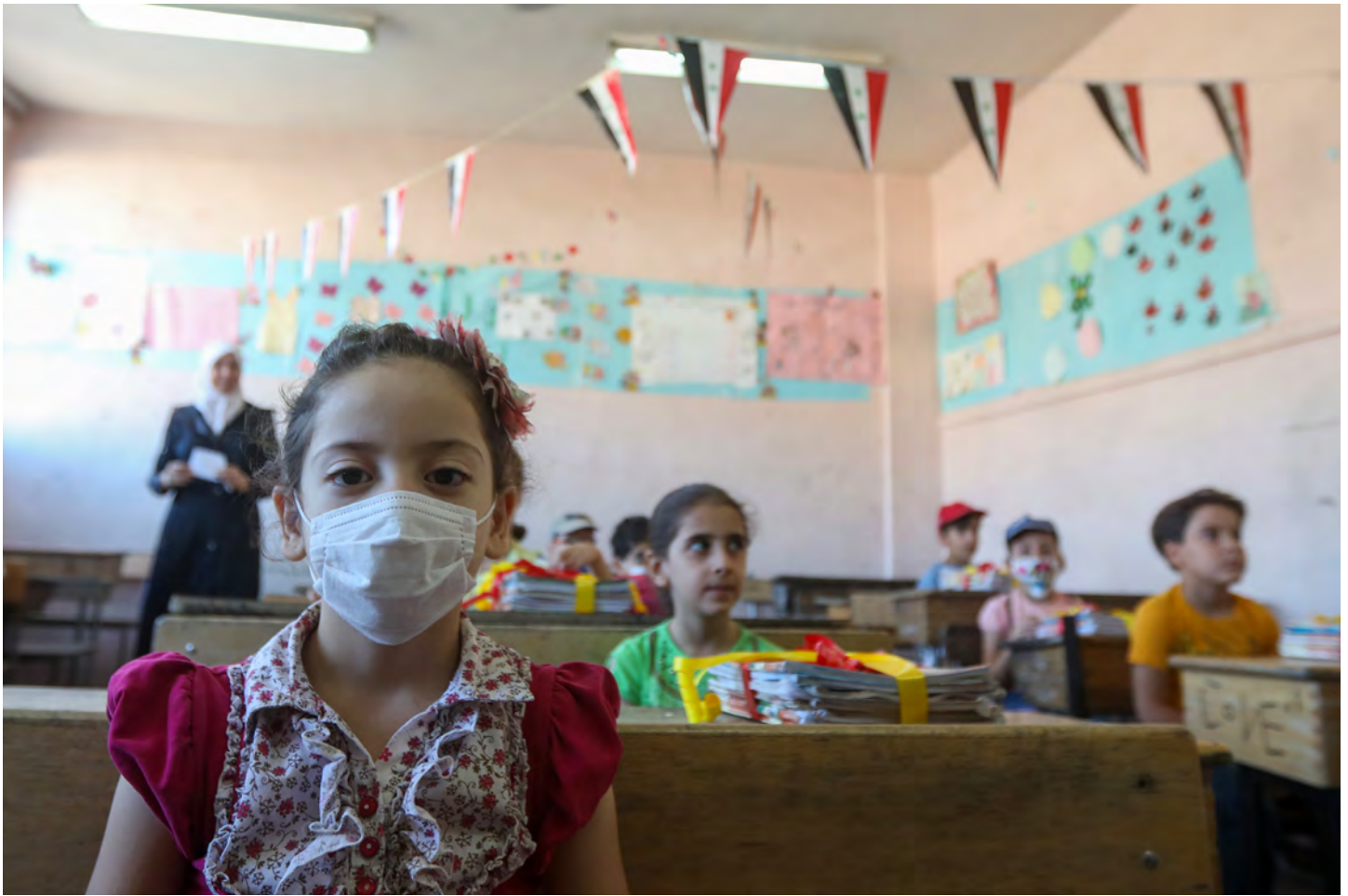
Photo above: Syrian pupils take their seats in class in the capital Damascus on Sept. 13, 2020, during the first day of the school year.

de facto authorities in other areas should be engaged to take responsibility for teacher salaries where resources are available and engage in systematic, standardized capacity building and training of teachers.